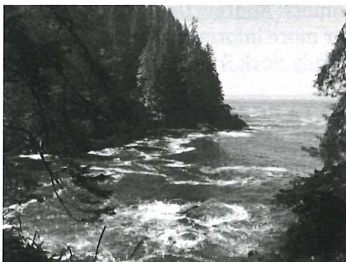
Beautiful Sombrio Beach, Juan De Fuca Trail, Vancouver Island

If your looking for VLMS Crests,Pins or Stickers they are available at the Library. Crests are $3.00 each Pins are $6.00 each and Stickers are $2.00 each. If there is any other VLMS items that you feel we should have such as T-Shirts, Hats,Jackets,Mugs ect. please let me know so we can talk it over with Council in September.The library will not be open due to the Auction on Please contact me at 250-360-0418 or email me at burnsidesylvan@yahoo.ca Keep on Rocking Sylvan