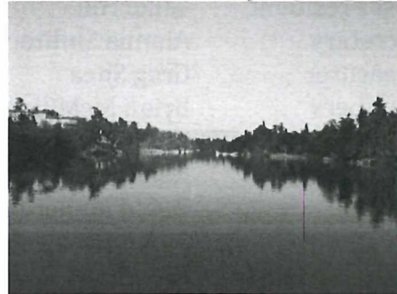
Sweet spot- Victoria BC