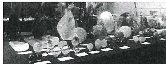
Photo: Rock and Gem Show 2015